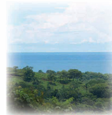
View from Phase 1 Lots